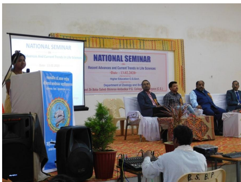
Welcome address by the convener.