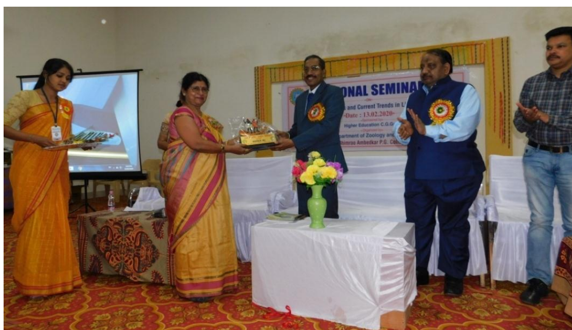
Guest were honored by offering memento and certificates