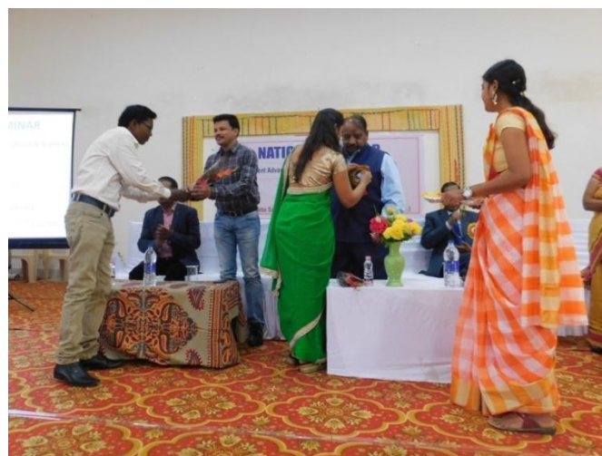
Welcome of the Speaker