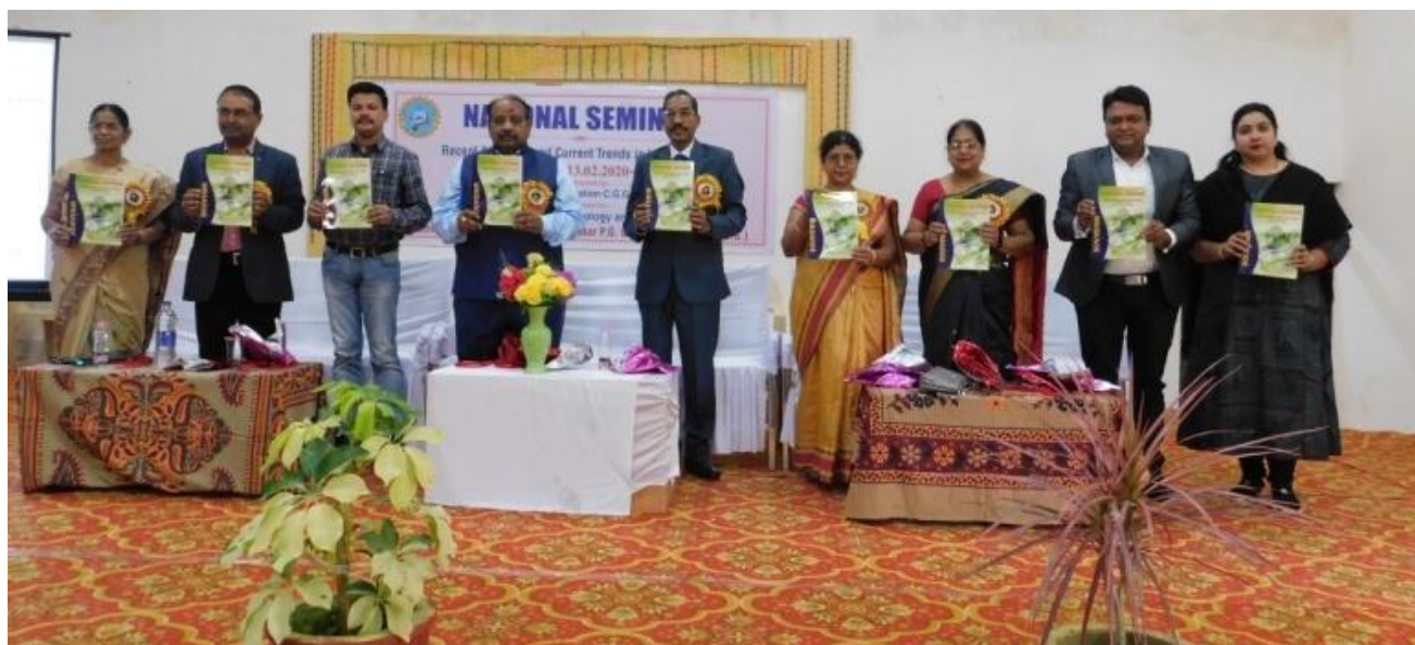
Release of souvenir by the Resource person, Guest and Principal

The winners of poster presentation competition and oral presentation were given prize and certificates by the guest.