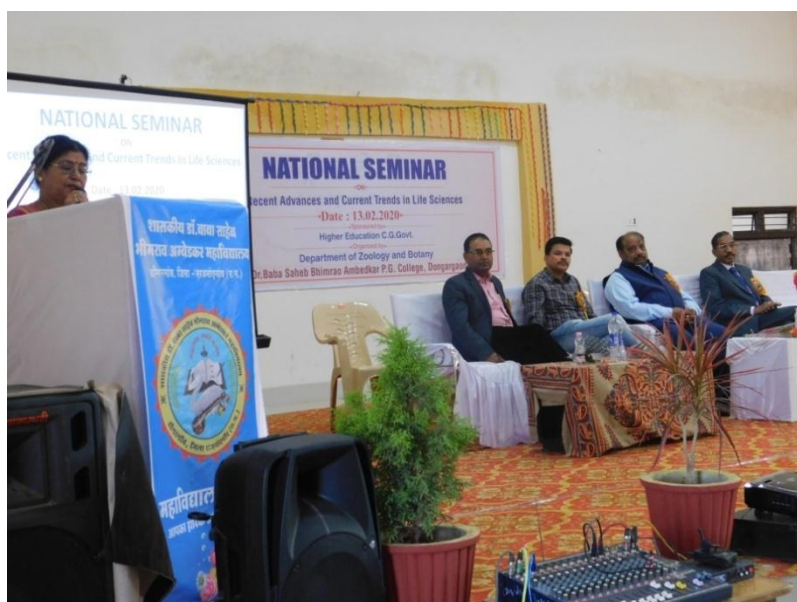
Welcome and introductory speech by the Principal.